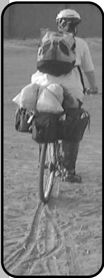
Off for a lesson