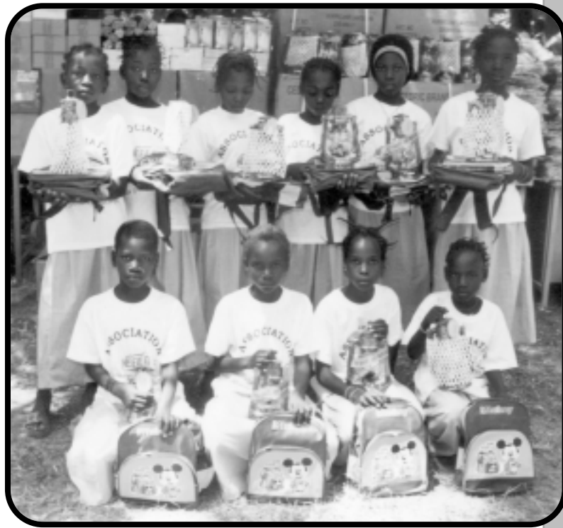
Ten of the 200 new students enrolled in school this year, thanks to your FBF donations.

To date, FBF has been able to commit $31,300 to the NEEDED college, with the majority of this funding coming from two very generous donors living in New York. NEEDED is well on its way to making the college a reality due to FBF's assistance and due to a €10,000 grant from a German company. Construction of a well has already begun. Ground will soon be broken to build a suite of classrooms. The plan calls for the college to open its doors to the first class of students this next fall. Should additional funds