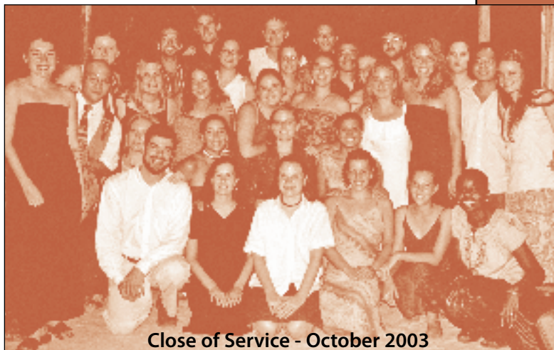
Close of Service - October 2003

I wouldn't have packed a single useful thing, if my mother didn't insist I take a camera. Before the Peace Corps I had never taken more than a few pictures, so a camera wasn't exactly topping my list of "essentials." Still, it seemed like a practical item to bring on a once-in-a-lifetime adventure. I packed the camera, replacing my 3.5 gallon vinyl sunshower, and don't regret it for a second. In Burkina I developed a love for photography, and realized that photography is really a way of honoring