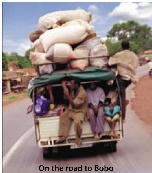
On the road to Bobo

Every Peace Corps Volunteer agonizes over what to pack before leaving the U.S. for two years. We're given 80 pounds of space, and everyone tries to figure out the best way to use this. What makes it so hard is that we don't really know what we're going to need, or what is going to be available. Who knew that you could buy a toothbrush in almost any village in West Africa? I certainly didn't, which is why I brought 12 of them. At the time, I thought it seemed reasonable. As did bringing four rolls of toilet paper, realizing neither the high availability of toilet paper, nor how absurd it was to think that four rolls might last two years. I was consumed by a process of carefully selecting 80 pounds worth of things I would later look at and ask, "Why on earth did I bring this?"