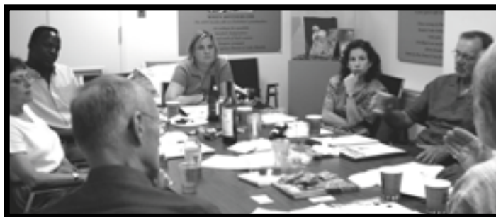
A group of Projects Committee members brainstorming.

the MCC-Burkina partnership, focused on female education, and our own FBF partnership with NEEDED in the Ouahigouya area. Both MCC and FBF are targeting resources to help meet a basic need that development experts in Burkina have identified as being important. Our program's strength is its cost-effectiveness and its grass-root participation. We witness village chiefs requesting that girls in their villages be able to participate. We see the investments that parents are making to enable their children to attend school.