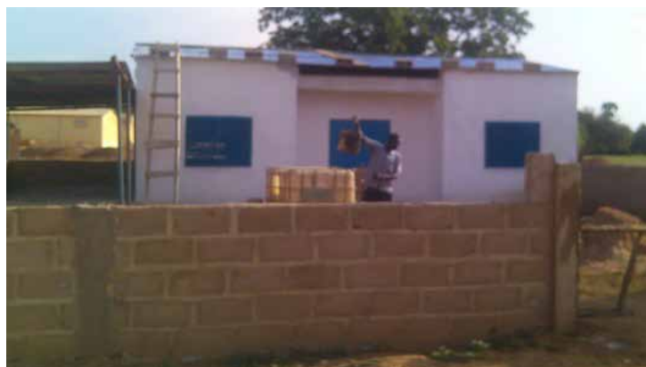
Near completion, the building to house the Sebba Community Library was donated by the village.