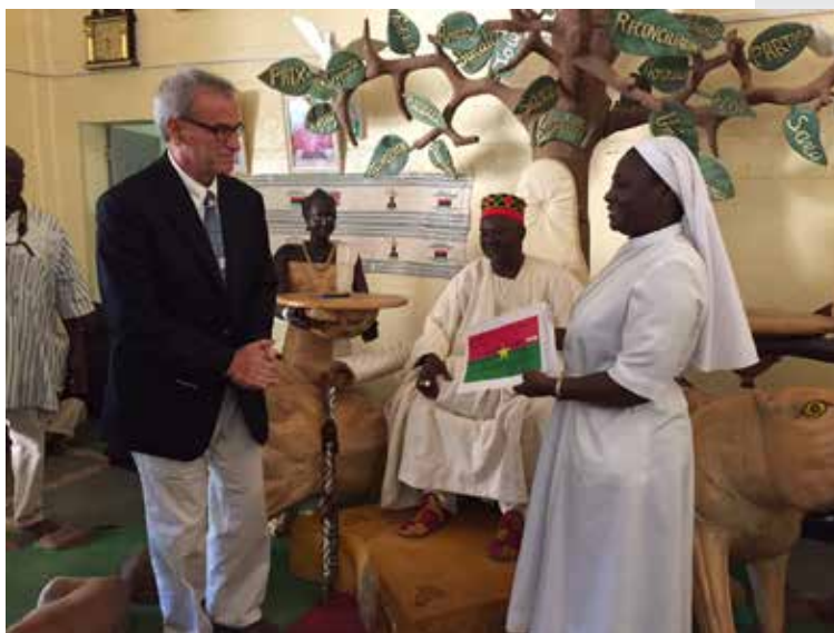
Home Kisito, a well-established orphanage in Ouagadougou, was chosen by the Mogho Naba to receive the $2000 prize donation.

Speaking in both French and More, I stressed the great benefits that volunteers have received over the decades through their absorption of the wisdom of Burkina culture and traditions, as embodied in various proverbs: “It is better