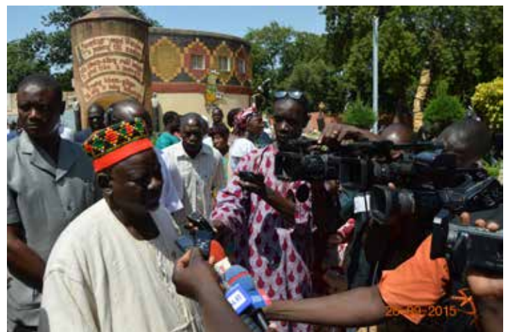
The Mogho Naba speaks with the press following the ceremony.