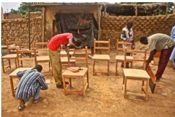
Local carpenters build chairs and other furniture for the Sebba library.