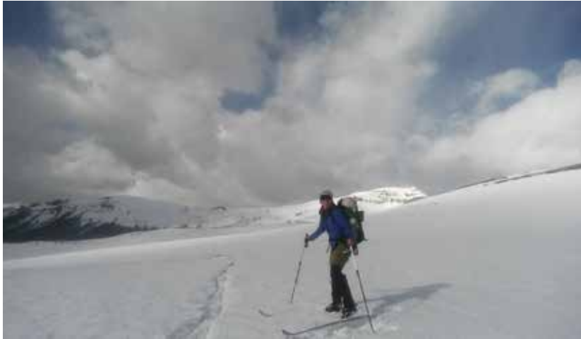
Skiing in Colorado

I was ready for the challenge, and began my northbound thru-hike on April 14 in the bootheel of New Mexico on the Mexican border. Bring it!