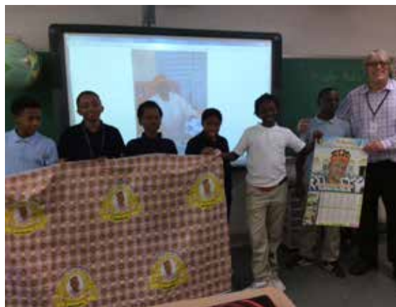
Students at Pontiac Middle School talk about the Mogho Naba and the meaning of peace.