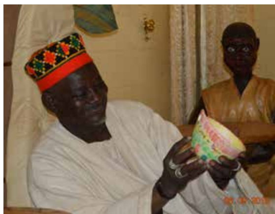
The Mogho Naba inspects the 150 fingerprints of Pontiac Middle School students on a gift received during the Award for Peace ceremony.