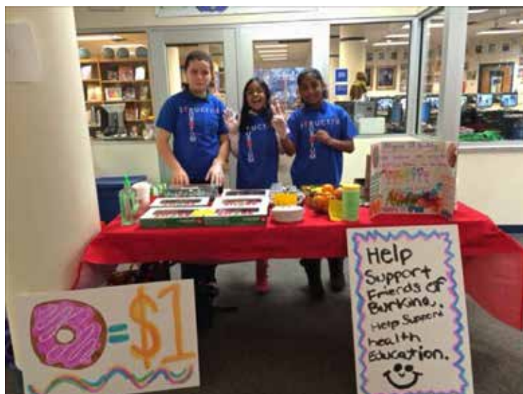
Students in Herndon, Virginia conducted a 3-day donut sale to raise funds for aspiring women in Burkina Faso to become primary-school teachers.

The young students then conducted a three-day donut sale to raise funds. Last May 26th, the Structile Robotum team presented a $500 check to Bony and myself. They stipulated that the money be used to enable aspiring women to become primary-school teachers in rural Burkina Faso!