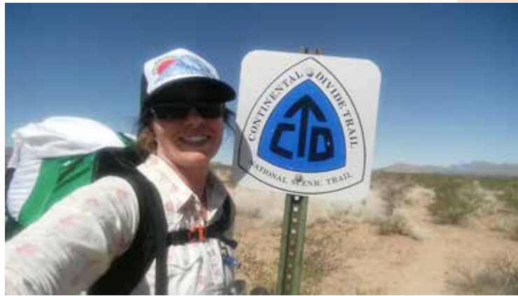
Day 1 on the CDT

Little did I know when I pulled a thick paperback from the shelves of the Ouahigouya Regional Center in Burkina Faso in the fall of 1999 that the direction of my life would be irreversibly altered. There are Mountains to Climb chronicled the 50-year-old author's hike along the 2,000+ mile Appalachian Trail, a journey that traverses 14 states along the east coast of the U.S. and attracts thousands of potential thru-hikers (those who complete the hike in one trip) each year. No matter that I had never backpacked before, I knew this was for me. This is what I would do after my service ended, even though I had only just begun my time in West Africa.