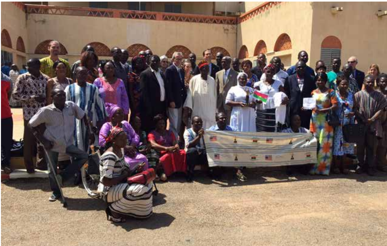
Attendees of the Award for Peace ceremony pictured in the Mogho Naba's courtyard.