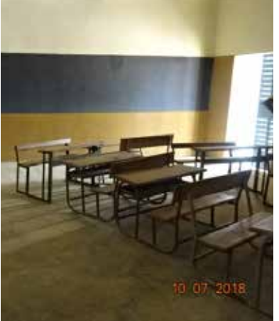
Before and after: A new school for Bourbo is complete!