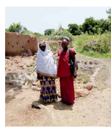
Two women farmers have joined the team of AIVDPL farmers participating in the program.

Yield measurements will also be taken on 24 fields from the group of farmers trained last year to evaluate the uptake and success of the improved crop production techniques. This will be a good test of how well AIVDPL has been able to change farmer behavior through training and engagement, and how far the new techniques go in improving yields and farmer livelihoods. The FBF project committee will be reviewing this yield data to determine how effective this project has been over the two years, and based on these results, will consider future funding.