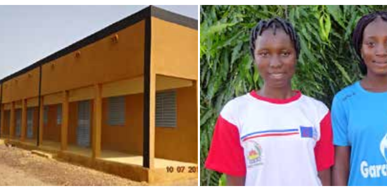
A new school for Bourbo and three post-secondary scholarship recipients

Every year has been a stellar year for the education of village girls in northern Burkina Faso since Friends of Burkina Faso (FBF) began lending our support to Association NEEED's girls' education projects in 2002. This past year is no exception. We have much to be proud of the accomplishments of the young girls and young women whose educations we have supported, and continue to support, in partnership with Assn NEEED.