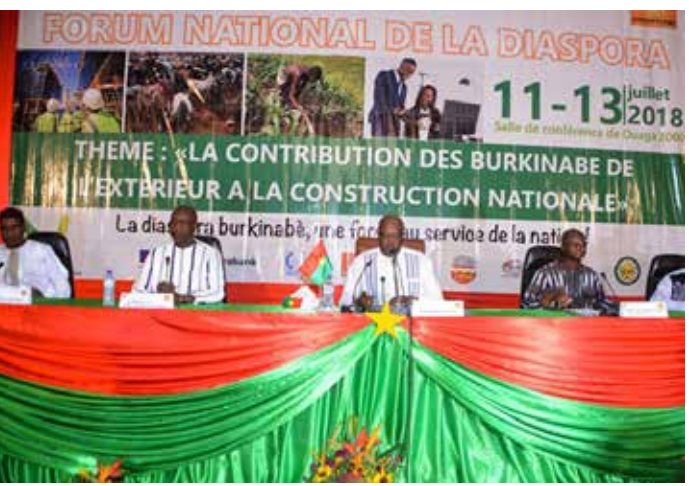
Burkinabé President, Roch Marc Kaboré, presides over the first national conference of diaspora.

Africa is an example of rapid change that is centered on access and measurable change. For example, Google is building an Artificial Intelligence (AI) Laboratory in Ghana. Cote d'Ivoire has brought online its supercomputer in its 'Centre National de Calcul', following the success we saw in South Africa, with Senegal in line for the third implementation. Through massive infrastructure projects, digital skills training for millions and investments into the African startup ecosystem, Google is tackling the problems with infrastructure and last mile connectivity. Other companies such as Microsoft, Uber, Facebook are present or planning to be integral partners as well. There are many initiatives such as the West Africa Regional Communications Infrastructure Project from the World Bank.