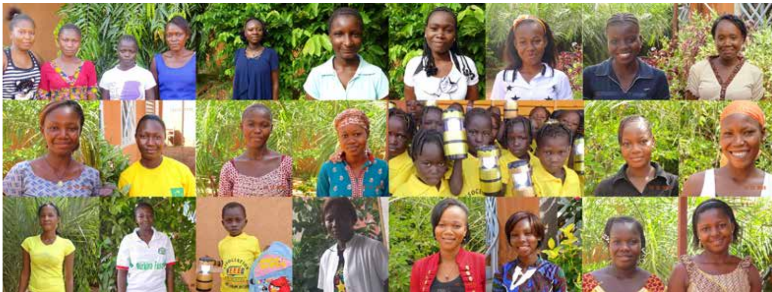
Since 1999, Friends of Burkina Faso has collaborated with NEEDED, supporting the education of nearly 4,000 girls.