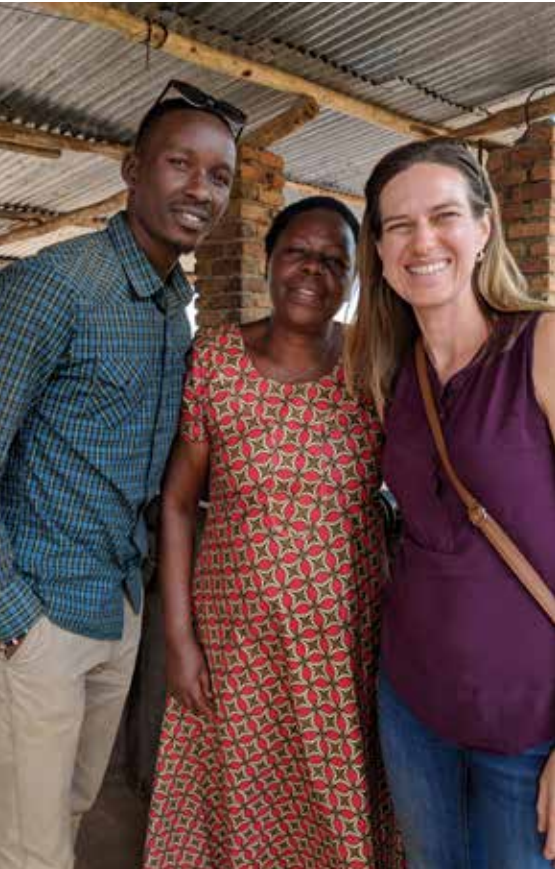
With coffee-producing friends in Rwanda

potential partners, and look for decaf coffee that was worth savoring.