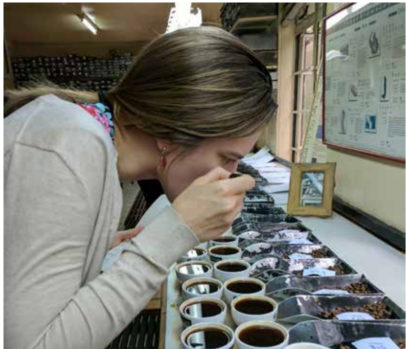
Tasting coffee in Kenya

allows us to share this coffee with customers across the US.