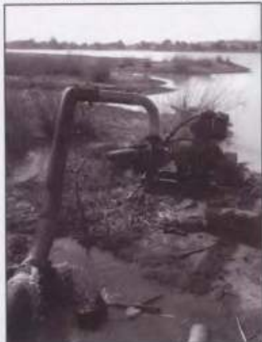
Irrigation equipment on Lake Bam.

They have also used their dues to fund needed repairs to the motorized pumps and to purchase cement to repair heavily used drainage channels.