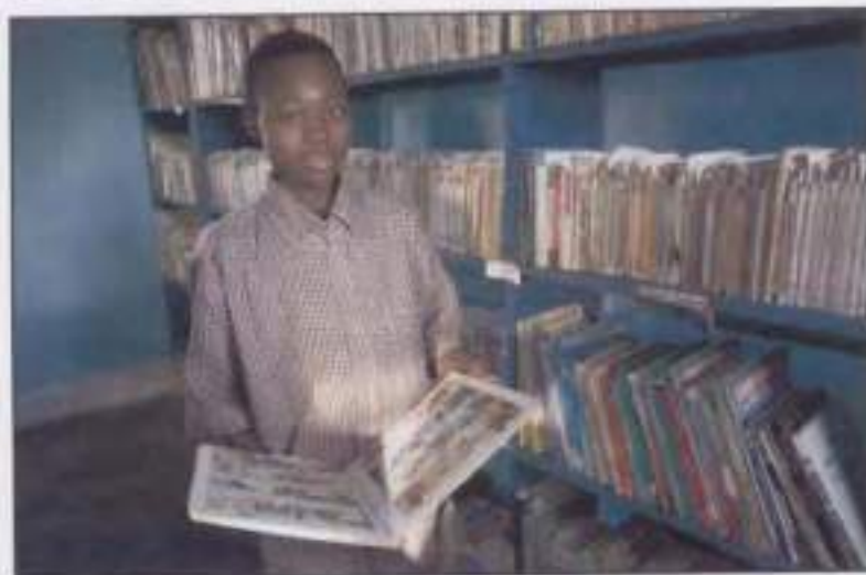
Boy reading a cartoon at the Bereba village library.