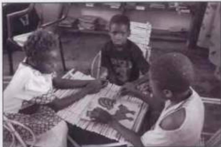
Puzzles are a big attraction at the Beraba village library.