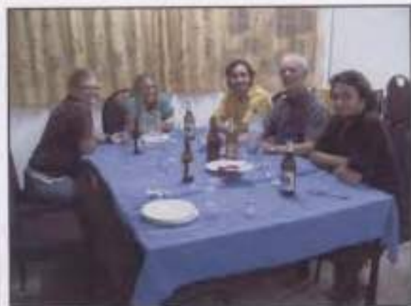
☞ Taking volunteers out to dinner in Ouahigouya.

We took them out to dinner and bought rounds of drinks. We listened late at night to hopes and fears, and tried not to offer too many suggestions. They made us proud of the best parts of our country and of our own service to it. We connected each other to the generations of Americans who have taken this step into the unknown and learned so much about themselves and the world in the process.