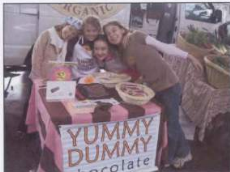
© The girls of Yummy Dummy Chocolate Co.

"Man cannot live by chocolate alone – but girls can!"