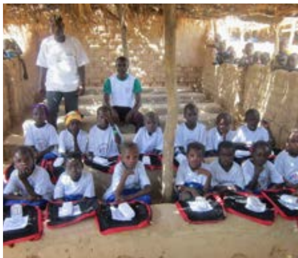
Young girls supported by the 'Lambs' Project 2013-2014 school year at a village primary school in Komtanga Bilingue.