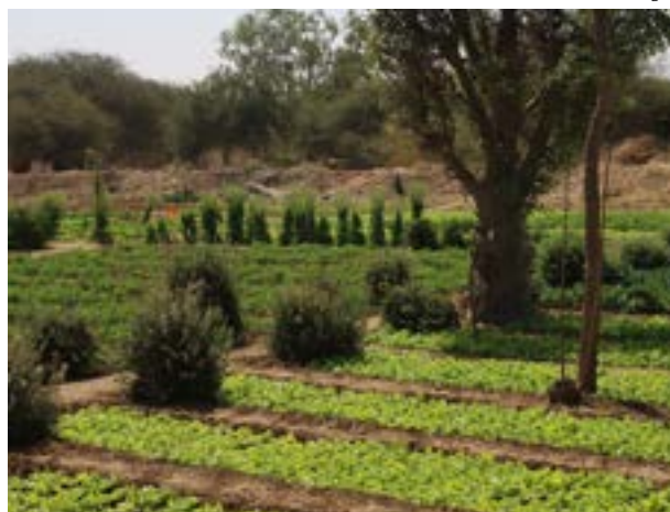
Djoiuiga Bouli Gardens