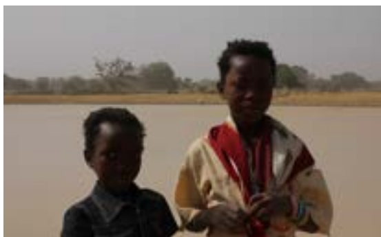
Basin Sis 2 school girls

Give Water Give Life is so very thankful to each of you who have contributed to the building of rainwater catchment basins (RCBs). In the past, we have great success in the Centre West of Burkina Faso, i.e. in Sisene village where a RCB prototype was built by the village in 2008. The Sisene RCB has generated a reliable source of water throughout the year, enabled farmers to irrigate gardens, created markets for produce (which has attracted wholesalers from neighboring Koudougou), increased employment, curtailed out-migration of the male labor force, and increased villagers' income—a model worth replicating.