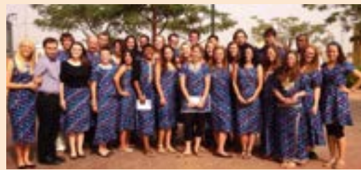
New PCVs swear in - January, 2014.