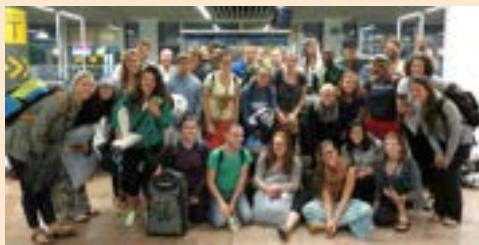
New PCVs about to fly to BF - October, 2013.

There are currently 110 Volunteers in Burkina Faso working in the areas of education, health and community economic development.